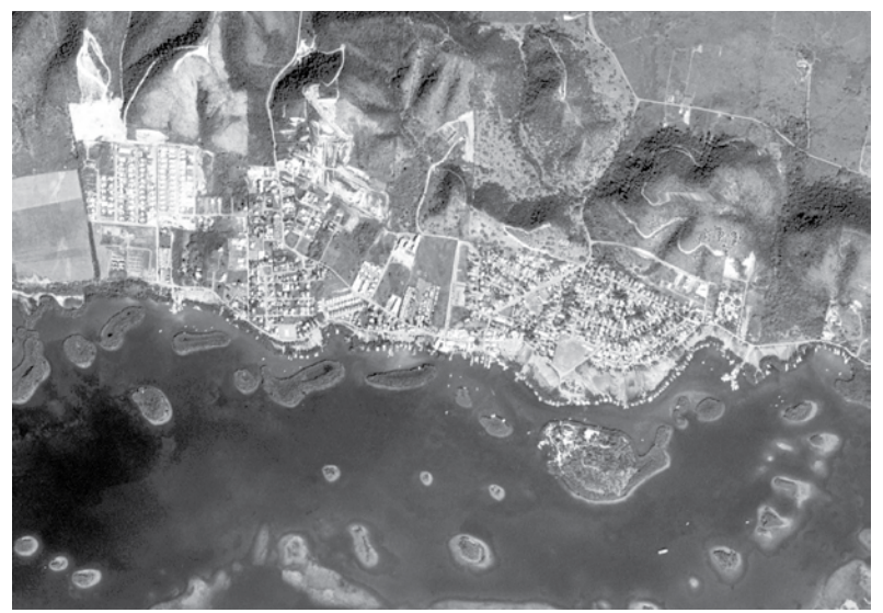
FIGURE 2. Aerial picture of La Parguera