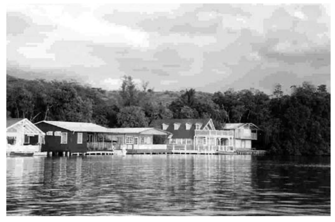
FIGURE 3. A group of casetas.

Usually surrounded by mangrove trees and always made out of wood, the casetas have been described as second homes that "allow numerous city dwellers...to indulge in fantasies of living with nature" (Jopling 1988: 176) (See Figure 3). This is perhaps the casetas' most peculiar feature: Unlike other documented instances of illegal building in Puerto Rico, La Parguera's casetas do not represent an attempt by the working and usually urban poor to acquire land in which to build their homes. To the contrary, caseta owners and users tend to be seasonal residents, who have been described by the press as "white collar squatters" (Gaud 2006b: 3), and by full-time residents with terms such as "upper class", "wealthy" and "professional"3; they include engineers, doctors, lawyers, business people, and even a federal court judge.