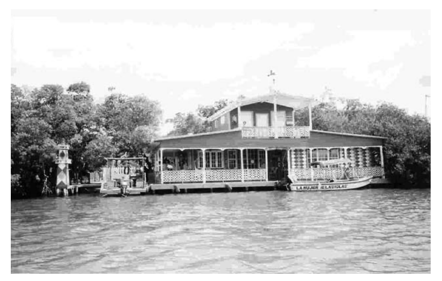
FIGURE 5. Caseta, yola and boat. Photograph by Rima Brusi-Gil de Lamadrid. Reprinted with permission.

real estate agents who use the characteristics of an area as "hooks" to sell property (Smith 1996): Proximity to nature and the rustic look associated with it are some of the main hooks in La Parguera, suggesting that a rural gentrification processes may be at work (see Ghoose 2004).