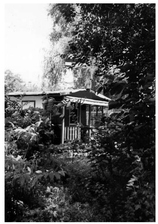
FIGURE 4. Casita in New York City.

This kind of construction has become symbolic of Puerto Rican specificity or cultural nationalism in the face of its colonial relation with the United States (Flores 2000). "Casitas" have become a common way to preserve Puerto Rican identity in places like New York (see Figure 4) and Chicago, for example, where they often become "a living installation, a living space of rescued images that reinforce Puerto Rican cultural identity" (Flores 2000). In New York, casitas built in empty, idle lots and carrying nostalgic names such as "Villa Puerto Rico" have been for decades part of an architecture of resistance, a source of pride and memory, an alternative